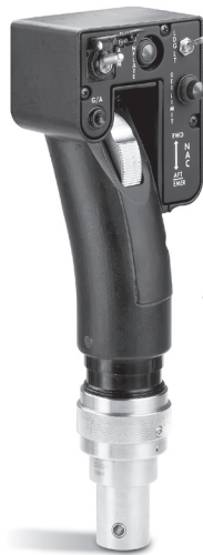
Collective Grip with Thumbwheel Switch and NVG Backlighting