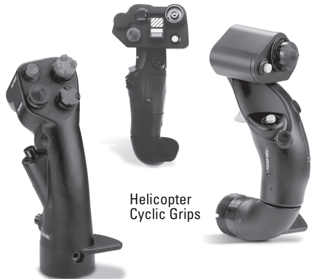
Helicopter Cyclic Grips