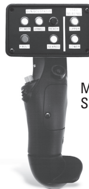
Military Ground Support Grips