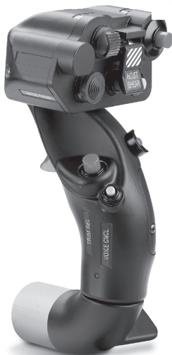
Cyclic Grip with Custom Switch Guards