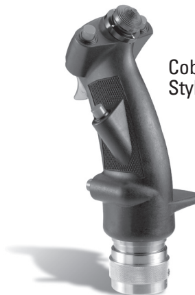
Cobra Style Grips